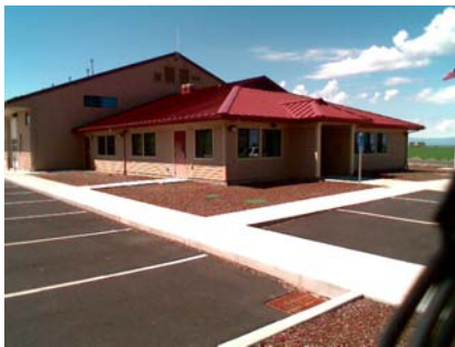
NE Plan Irregularity Primary