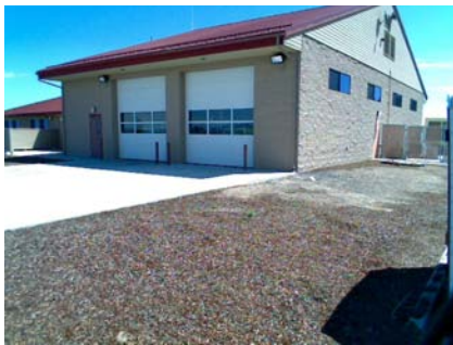
SW General Site