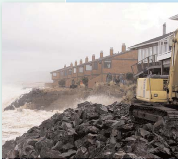
Erosion during a storm on January 5, 2008 caused part of a riprap wall to fail in the town of Neskowin and came close to completely destroying one home (photo courtesy of the Breakers Condominiums).

James Roddey Earth Sciences Information Officer james.roddey@dogami.state.or.us (971) 673-1543 (direct line) (503) 807-8343 (cell)